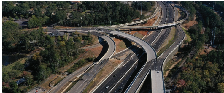
An aerial photo captures the new interchange at Colonial Life Boulevard and all of the newly constructed ramps and bridges.

Phase 1 construction is nearly done. All travel lanes and ramps on I-26 and I-126 are fully open and in their final locations. Remaining asphalt paving and construction work will be completed using temporary lane closures when interstate traffic is light. Final paving and roadwork will be completed as paving season resumes in spring 2025.