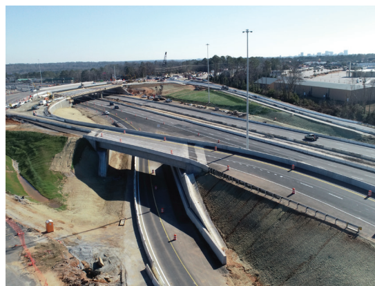
The new collector-distributor ramp from I-20 westbound to I-26 westbound passes under the new Broad River Road on-ramp to I-20 westbound.