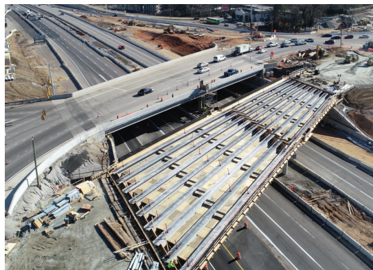
An aerial photo of construction on the Broad River Road westbound bridge.