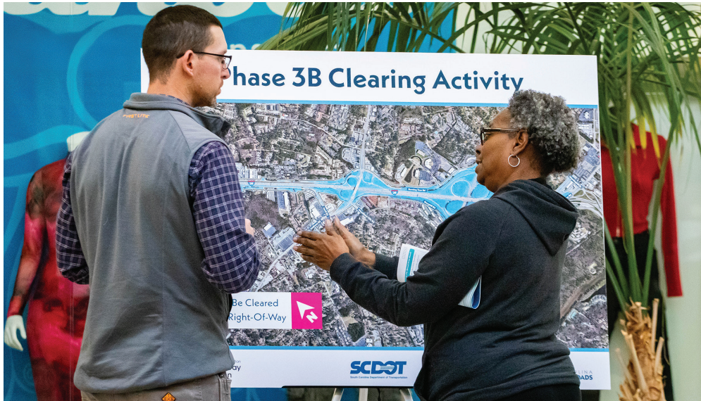
A community member reads an information board at the Phase 3B Public Meeting

This January, the Carolina Crossroads Project team held a public meeting at Dutch Square Mall to inform the community of the official start of Phase 3B.