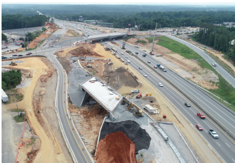
Construction of new bridge ramp from Broad River Road to I-20 westbound.

As mentioned previously, Phase 2 has opened the first new Broad River Road bridge over I-20. More progress has also been made.