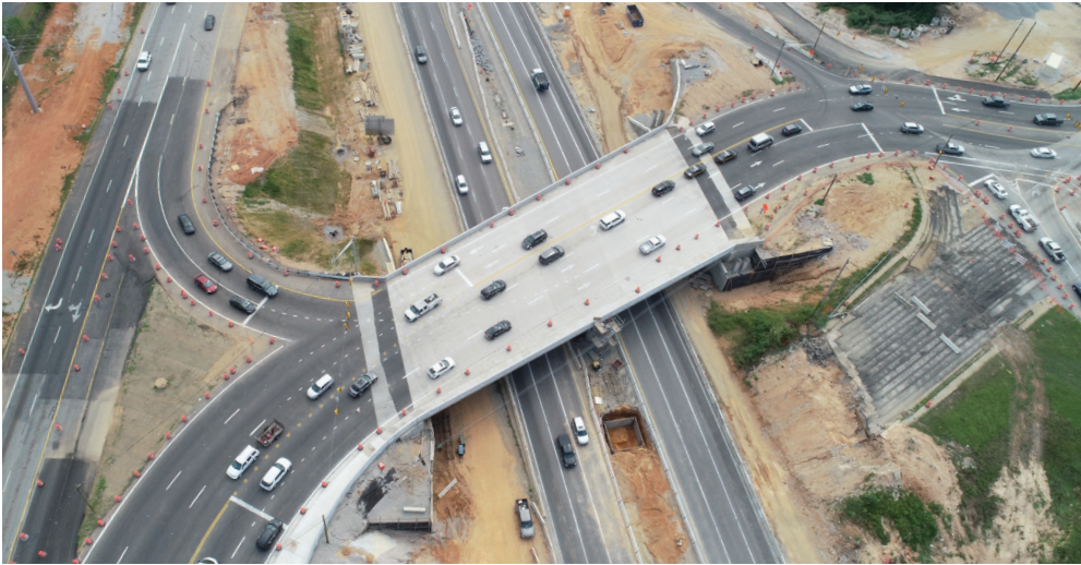
An aerial view of the new bridge over I-20 at Broad River Road.

On May 18, Phase 2 officially opened a new bridge over I-20 at Broad River Road. This bridge is a key component of improving the I-20 Interchange at Broad River Road.