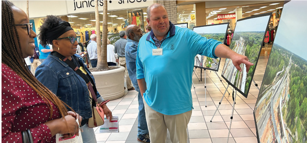
Carolina Crossroads project engineer shares Phase 1 updates with residents.

On April 9, SCDOT hosted a public meeting at Dutch Square Center to share information about the construction re-phasing of the Carolina Crossroads Project and provide overall project updates. This meeting was an opportunity for the public to learn more about the changes and the impact on the community. In case you missed it, here is a recap.