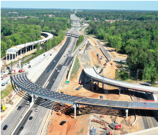
Progress of three new bridges being erected along I-126. Phase 1 is approximately 78 percent complete.

Exciting progress is being made within the Phase 1 project footprint, especially along Colonial Life Boulevard. What began as site clearing has now become the unmistakable makings of bridges. What may be most noticeable is the erection of steel girders above and alongside I-126 which will support the bridge deck above.