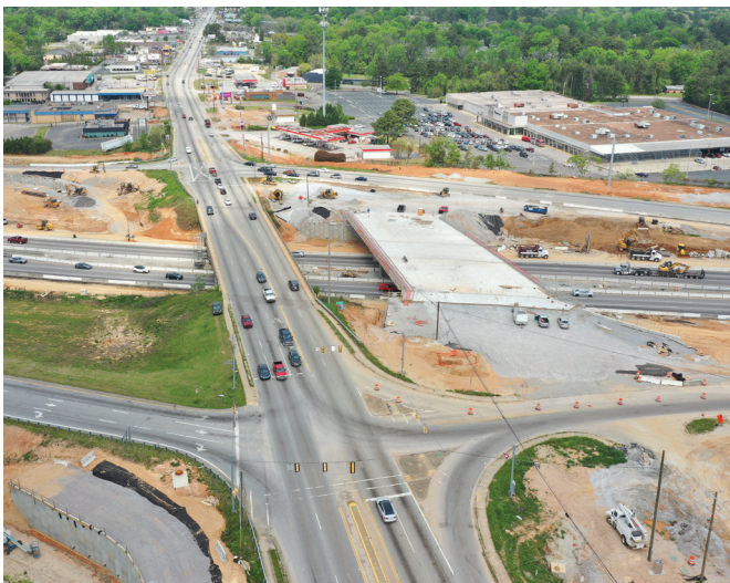
A bird's eye view of the existing Broad River Road Bridge, as well as the new bridge currently under construction. The new bridge is expected to open mid-May.

Like Phase 1, Phase 2 has a milestone bridge opening on the way. The future southbound Broad River Road bridge, extending over I-20, is expected to open mid-May. The bridge deck and approach slabs have been poured, and the asphalt approaches will soon be complete. Once the bridge opens, traffic in both directions of Broad River Road will be redirected over the new bridge. The current bridge will eventually be demolished and rebuilt to make way for the future northbound Broad River Road traffic.