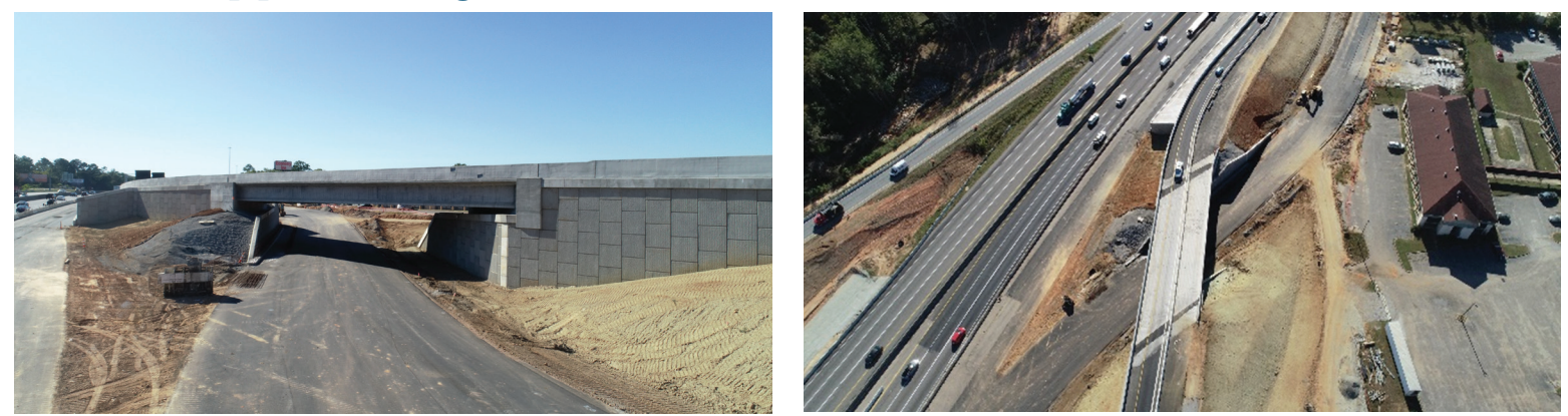
The newest bridge in Phase 2 connects Broad River Road Traffic to I-20 and I-26 westbound. It crosses over a new collector-distributor ramp.

Another new bridge has opened within Phase 2 of the project. This one is part of the new on-ramp from Broad River Road to I-20 westbound.