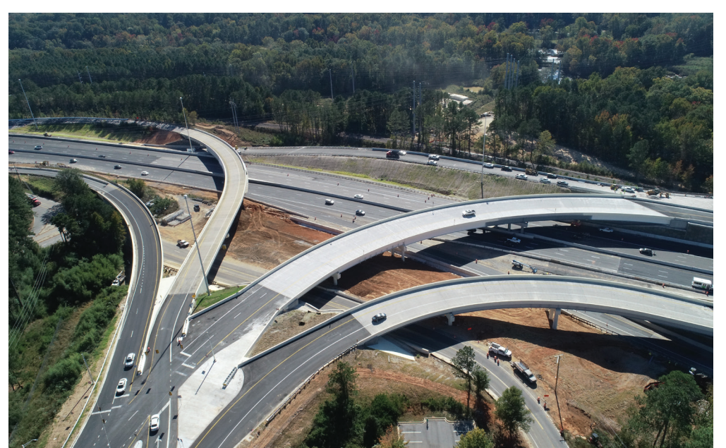
The new, full access interchange at Colonial Life Boulevard allows drivers to more safely travel from I-26 to Bush River Road.

The new bridge over the Saluda River (Bridge 35) is complete and the new, full access Interchange at Colonial Life Boulevard is now officially open. This marks a major milestone for the Carolina Crossroads Project.