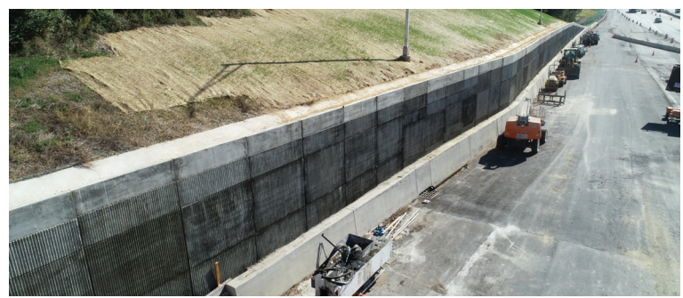
Construction of the retaining wall along I-26 westbound between Highway 378 and the Saluda River.

Phase 1 of the Carolina Crossroads Project is on track to reach substantial completion in early spring 2025.