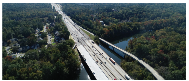
Aerial photo of I-26 facing east toward Charleston.