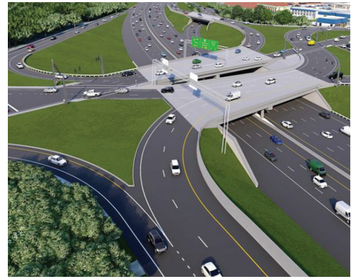
Phase 2 design aerial view