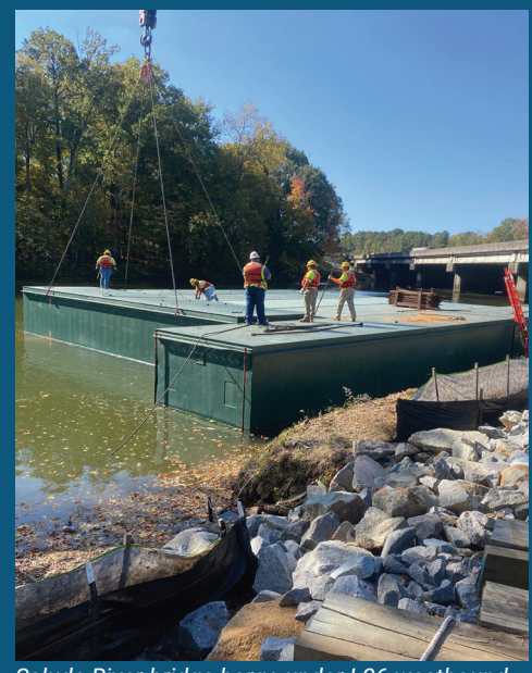
Saluda River bridge barge under I-26 westbound

Barges are large vessels with flat decks. They are used for storage and to support heavy machinery, like large cranes, during the construction of drilled shafts and bridges.