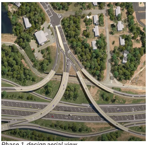
Phase 1 design aerial view