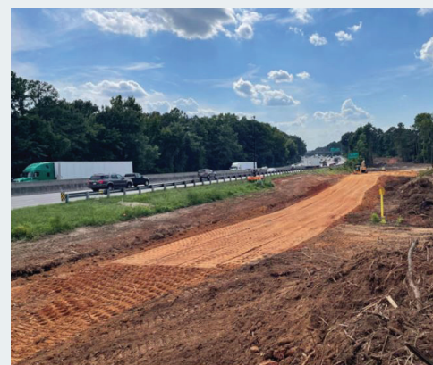
Construction of collector-distributor ramp to connect I-20 westbound with I-26 westbound.

Some of the most visible activity includes construction of a new collector-distributor ramp from I-20 westbound to westbound I-26, and tree clearing along I-20 eastbound in preparation of the Garner Lane relocation.