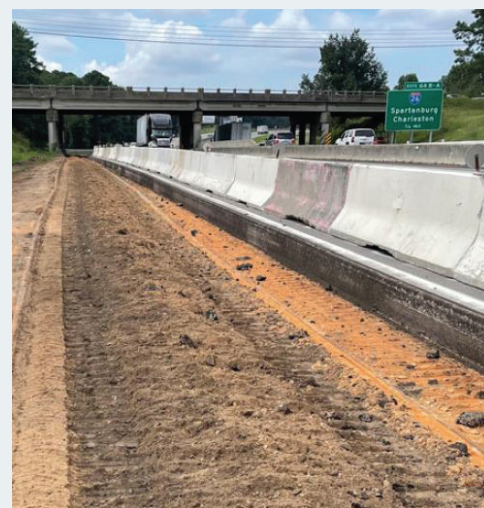
I-20 eastbound widening near Broad River Road.