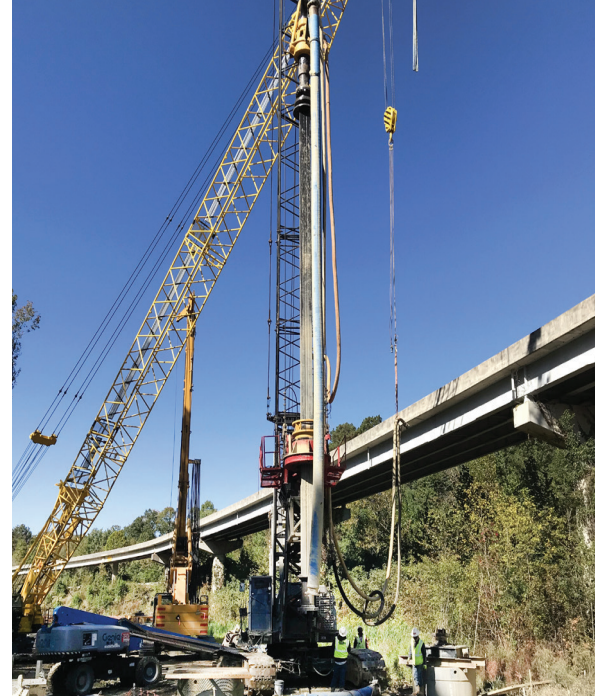
Left: Thirty-inch force main pipe fitting with a 45-degree bend. This is being installed in the area between eastbound I-126 and Saluda River. This is part of City of Columbia's sewer line relocation to allow construction of Phase 1. Right: Drilled shaft work is underway to lay the foundations for a new bridge at the Colonial Life Boulevard Interchange at I-126.