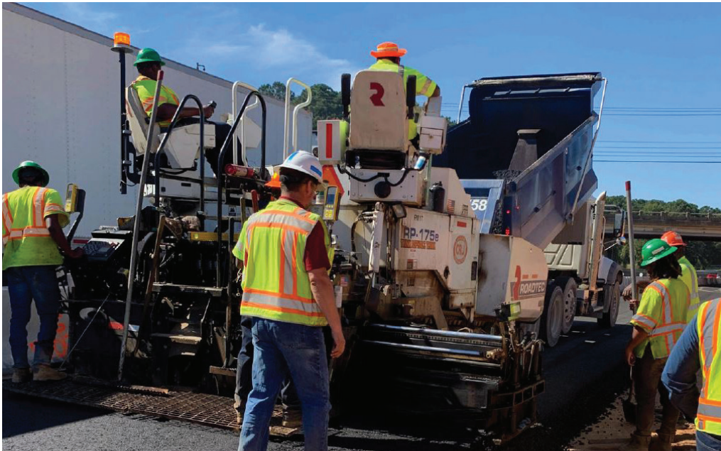
Roadway widening along I-20 westbound near the offramp at Broad River Road. Traffic will be shifted to this lane during construction of the Broad River Road bridge.