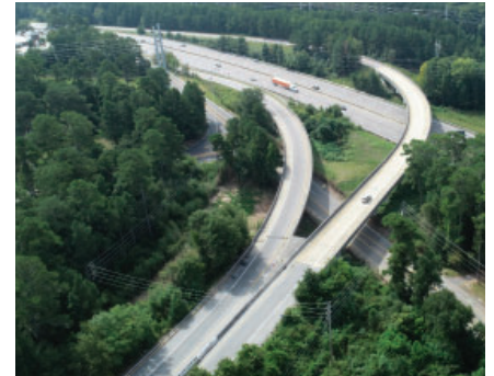
Phase 1 pre-construction aerial photo

The groundwork has been laid for construction of the Carolina Crossroads Project to begin. Archer-United Joint Venture (AUJV) has been selected as the construction team, and major construction activity is expected to begin Spring 2022. Wrap up of Phase 1 should be late 2024.