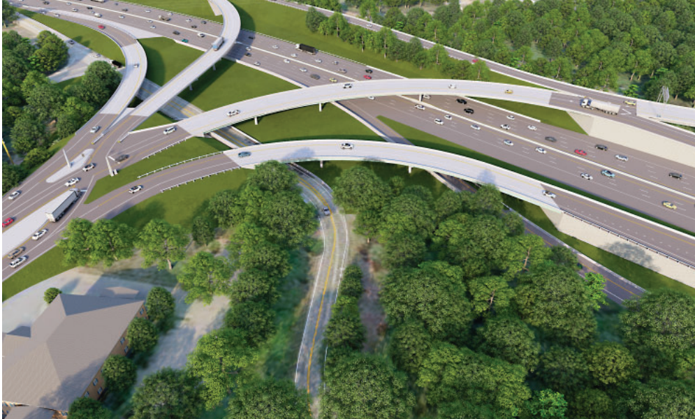
Carolina Crossroads Phase 1 final concept architectural rendering

Phase 1 is the first Carolina Crossroads Project for the improvement to the I-20/I-26/I-126 interstate corridor. It will provide a full access interchange at Colonial Life Boulevard and I-126.