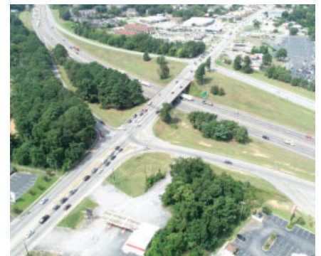
Phase 2 pre-construction aerial photo

Shortly after Phase 1 shifts into gear, Phase 2, Broad River Road at I-20 Interchange, will begin. This project will make it easier for drivers to access Broad River Road from I-20, as well as minimize congestion for vehicles changing from I-20 to I-26.