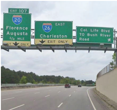
Colonial Life Boulevard exit

Phase 1 is the first Carolina Crossroads Project for the improvement to the I-20/I-26/I-126 interstate corridor. It will provide a full access interchange at Colonial Life Boulevard and I-126.