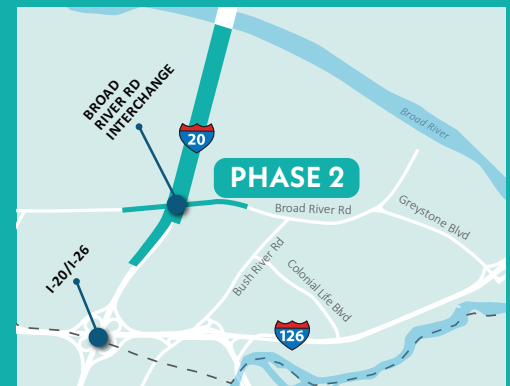
Phase 2 of the Carolina Crossroads project focuses on the Broad River Road interchange at I-20 and includes a new ramp connecting I-20 west to I-26 west.

The meeting will be held Tuesday, August 30, 2022 from 5:00 - 7:00 pm at Dutch Square Center, 421 Bush River Rd, Columbia, SC 29210.