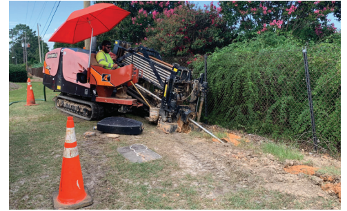
Fiber Optic Underground Horizontal Drilling Machine for the relocation of fiber optic lines I-26 east

Drivers traveling along I-126 east may see large equipment needed to remove rock and dig trenches to make way for the City of Columbia's 30" force main sewer line. Along I-26 east, drivers may see drilling to relocate fiber, equipment clearing access to areas for utility relocation, and bucket trucks relocating power lines.