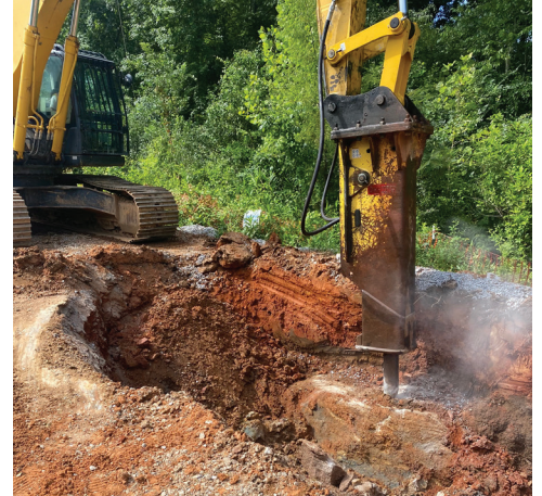
Rock hammer breaking rock for installation of the 30" Force Main Sewer between I-126 east and the Saluda River

By having a dedicated utility coordination team to actively lead this critical phase of the construction process, we're able to streamline several utility relocations and get them well underway in order to begin major roadway construction activities.