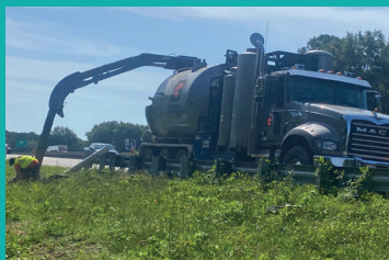
Phase 2 Potholing utility work

Several areas are also being cleared to prepare for construction once final permits are obtained.