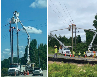
Relocating powerlines near I-26 west on McSwain Drive

Phase 1 utility work includes the relocation of water and sewer lines in partnership with the City of Columbia and the City of West Columbia.