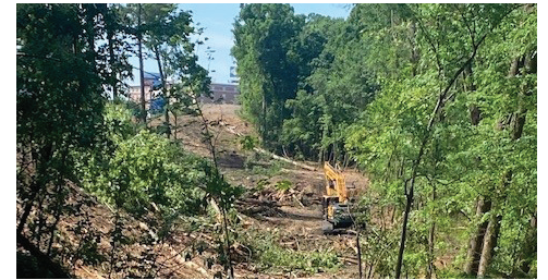
Clearing along I-26 east providing new right of way next exit ramp to US 378