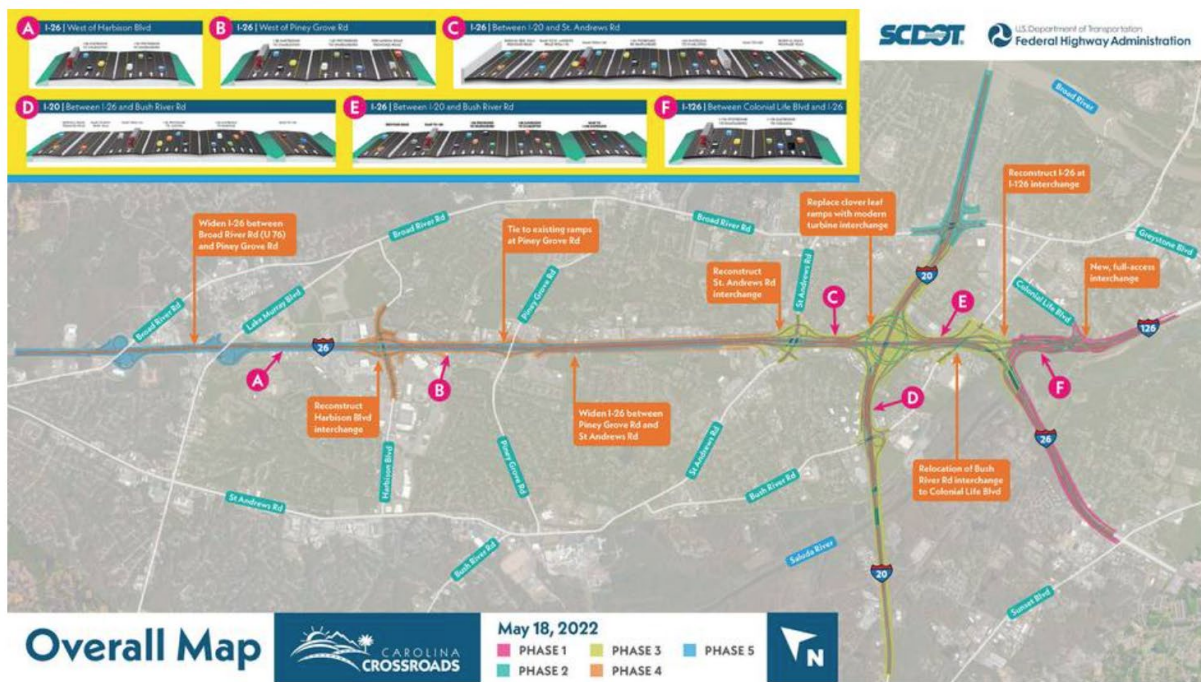
This map shows an overall view of the Carolina Crossroads project.

Work is also underway to improve the Broad River Road interchange at I-20. Temporary shoulder barriers to protect workers should be erected on that stretch of road in coming weeks, Klauk said.